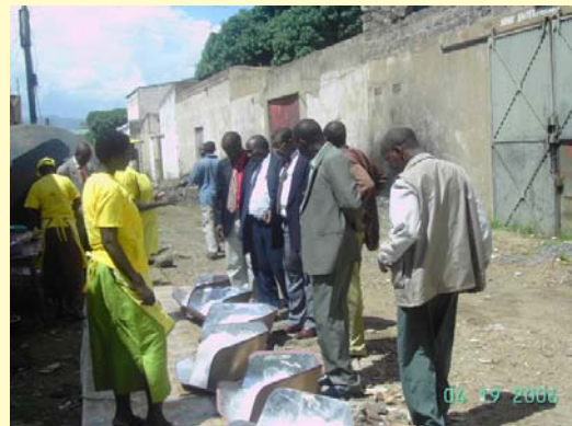
A demo on the sidewalks of Perch Hotel Kisumu