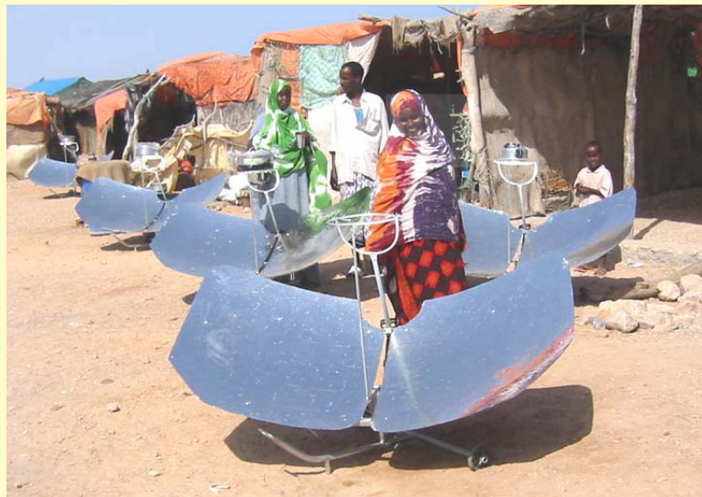
EL-Didhir village- Somalia

"Visit Moyale and demonstrate the use of the cooker."