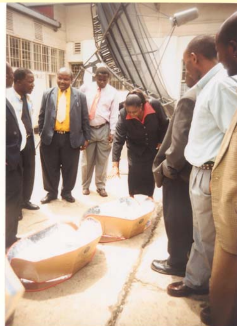
Explaining the cookit- Nakuru

Editor's note: SCI appreciates and welcomes this gesture.