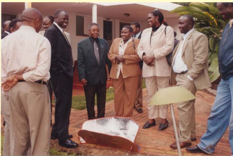
Regional Director explains the wonder of the Cookit - Embu

SCI (EARO), expressed gratigude at the opportunity of meeting with key planners in Kenya and hopes that the awareness raised will bear much fruit. That many Kenyans living in sun - rich fuel scarce regions will get to know and use the Cookit and other solar cooking technology models.