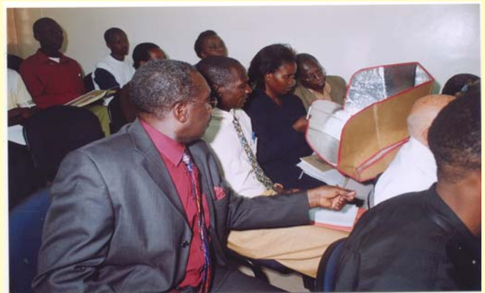
Participants marvel at the simplicity of the cookit- Methodist Guest House - Nairobi.

Just imagine..... a contribution of 1000/- will give a family of 6 a solar cooking kit i.e. a solar cookit, a cooking pot and lid, 4 cooking bags, a water pasteurization indicator and an instruction booklet) You will have reduced the 2.5 billion figure!