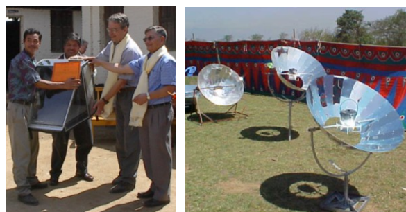
Fig. 10, 11, 12 Handing out solar and sustainable devices of Rotary Matching Grant projects

Where possible beneficiaries pay 15 percent of device costs to show a real commitment. Some projects also have an educational component of teaching schools how to make and use simple panel cookers. Another includes making bio-mass briquettes for fuel from any waste material (grass clippings, shredded leaves, newspapers, cardboard) in hand operated presses. Briquette programs empower women to become micro-entrepreneurs selling briquettes for use in efficient stoves. I selected FoST as the primary organization responsible for training of the villagers, fabricating the devices and coordinating with Village Development Committees and Rotary. When I am not in Nepal, we communicate through e-mail.