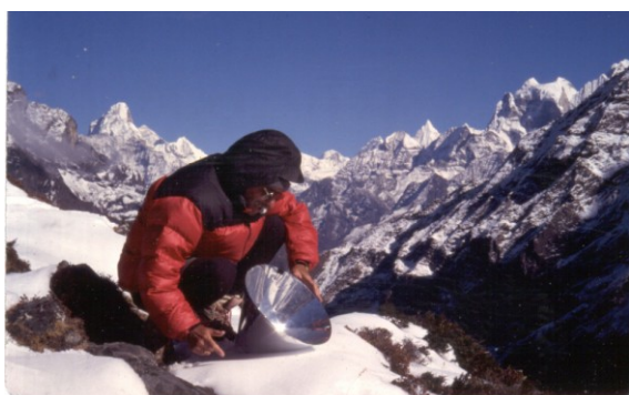
Fig.4 Solar Backpack “Trekking” Cooker (made by FAST) preparing food or melting snow for drinking

- Solar Backpack “Trekking” Cooker (400 gram). I designed this roll-up backpack cooker to be fast and effective in demonstrating solar cooking in remote and rural areas as well as in the cities. Because of its light weight and small size, I always carry it with me, just in case the right opportunity presents itself to discuss solar or to use it (fig.4, 5, 6). It pasteurizes a beverage can-size pot of water, or prepares soup or tea in 20 minutes. Rice takes 35 minutes to cook.