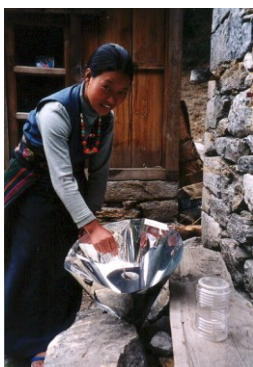
Fig.5 Lodgekeeper learns about solar cooking