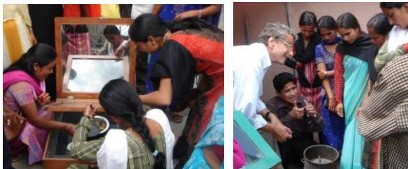
Fig.15, 16 Orientation training of Alapot women group

A Rotary Matching Grant provides machinery, plus enough materials for 80 students to fabricate devices, and learn how to introduce them to 180 families. SRE even set up a temporary workshop in the impoverished village of Alapot to train selected villagers (Fig.15, 16). This could be the start of a “Solar Village”.