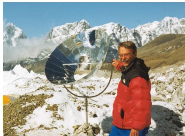
Fig.7 Parabolic “Sagarmatha” solar cooker at Everest base camp (made by FAST)

- I designed a powerful, collapsible, lightweight (3.5 kg) parabolic solar cooker for trekking agencies and households. In the year 2000, I installed this 1-meter diameter cooker at Everest Base Camp for use of the Everest 2000 Environmental Clean-up Expedition (fig.7). If trekking groups and expeditions would use solar and heat-retaining technologies, they would automatically disseminate solar cooking, providing a nice multiplier effect. Bringing lightweight collapsible parabolic cookers to households in remote villages reduces transportation costs. My design has been made available for free to reputable Nepalese organizations.