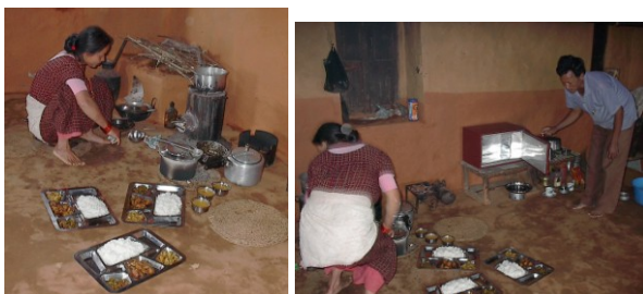
Fig.8 Rocket stove Fig.9 Heat-retention box both used in rural villages

When there is not enough sun to solar cook, it is important to have an alternative, environment-friendly cooking solution that is healthy, minimizes smoke, and saves fuelwood, kerosene, gas or electricity. Therefore I now follow an INTEGRATED approach to solar cooking and water pasteurization, adding very efficient, almost smokeless, fuelwood cookstoves to the solar programs for greater success. These so-called “Rocket stoves” have been developed by Approvecho NGO in the USA. Rocket stoves in combination with heat-retaining boxes (Fig.8, 9) reduce fuelwood consumption by more than 50 percent compared to traditional stoves. Only 3 twigs of wood are needed to cook a meal for a typical family. One has to slowly feed the wood into the stove. Using a “skirt” around the pot increases the efficiency even more by guiding the hot flue gases between pot and skirt.