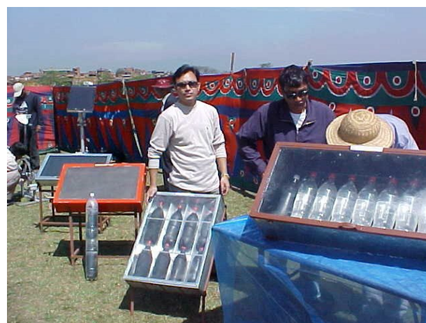
Fig.3 Water Pasteurizers - different types by FoST

- Promote simple solar dryers and water heaters. These devices are more easily accepted and can serve intellectually as “stepping stones” towards similarly built solar cookers. Drying fruits, herbs, vegetables and meats can provide income generation. Solar showers are getting somewhat popular now on certain trekking routes. Solar water heaters have been “mainstream” in Kathmandu valley and the bigger cities for many years.