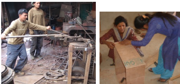
Fig.13,14 Metalworking & carpentry hands-on training

sources of energy, 3) disseminate Renewable Energy (RE) devices creating high demand, 4) stimulate small RE businesses, and 5) improve quality of life for the poor and Nepal as a whole. SRE will teach solar thermal (cookers, dryers, water/space, pasteurizers), fuel-efficient stoves, Photo-Voltaics, WLED lighting, small-scale hydro, bio-gas, composting (toilets), “green building” techniques, social impacts, plus training in metalworking, carpentry (Fig.13, 14), and small business skills.