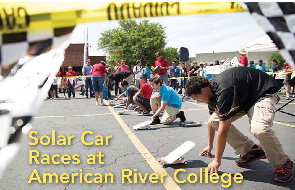
Solar Car Races at American River College