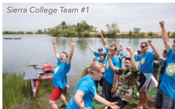
Sierra College Team #1

We hope that your school will consider participating in the 4th Annual NCSR on May 8 and 9, 2015. For an overview of the program or visit smud.org/solar-regatta .