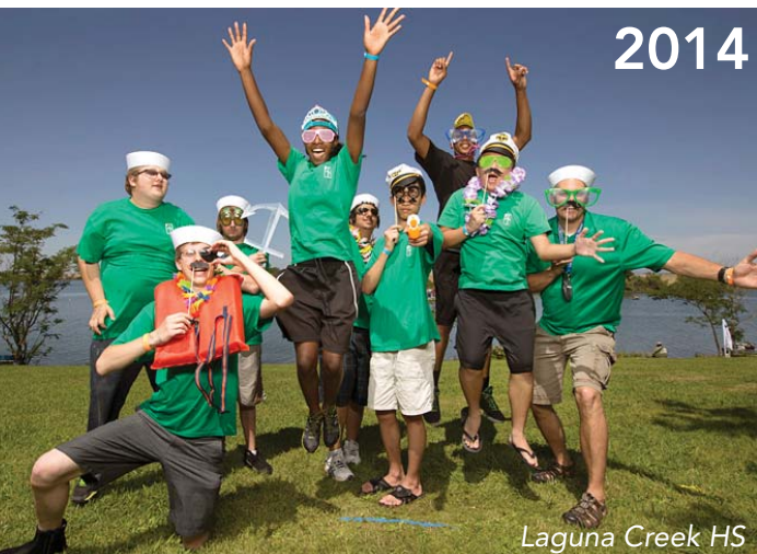
Laguna Creek HS

The 3rd Annual Northern California Regatta welcomed a new collegiate competition division. The weather was perfect and over 300 people