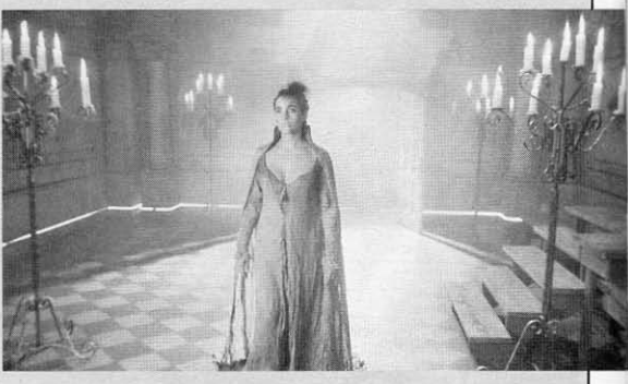
Now it's the guys' turn to ogle as Fright Night-Part 2 presents the sexy vampire Regine (Julie Carmen).